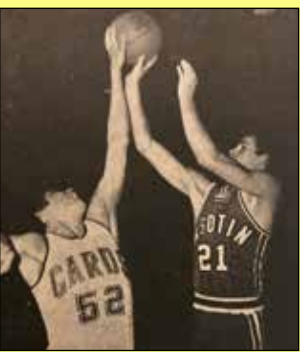
Pioneer Portraits (see page 6)