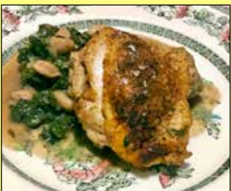
Chicken Braised with Kale and White Beans (see page 7)