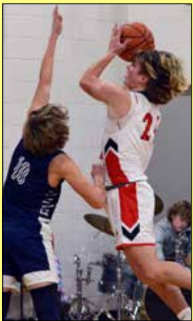
Cardinal Basketball (see page 5)