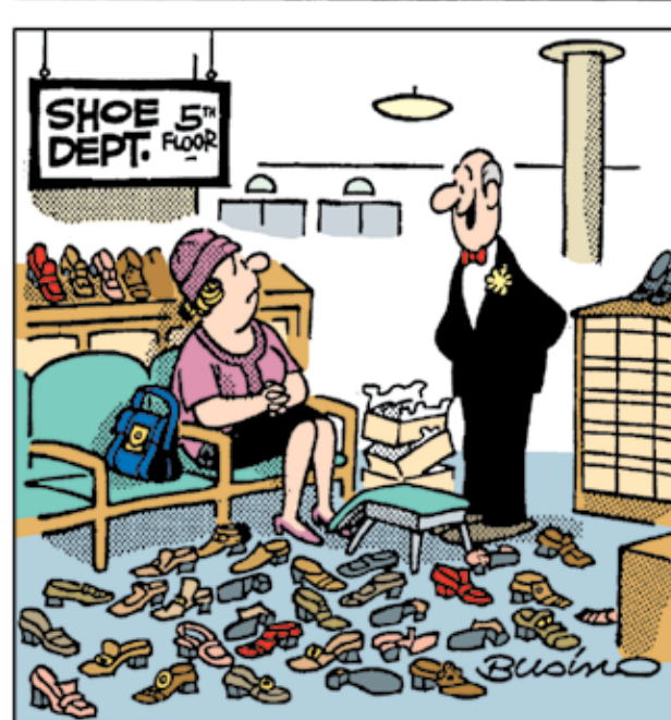
"Your clerk will be with you as soon as we can coax him back off the window ledge."