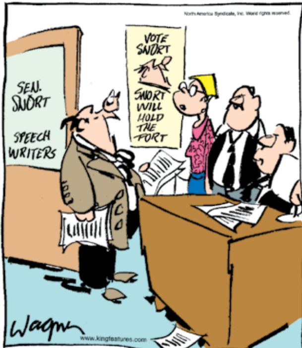
"I told you not to clutter up my speeches with issues!"