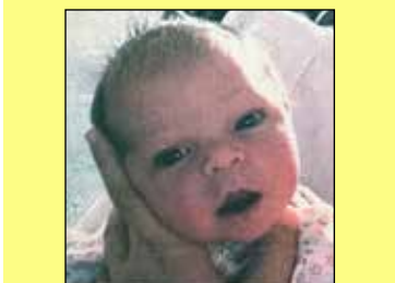
Pioneer Portraits (see page 6)