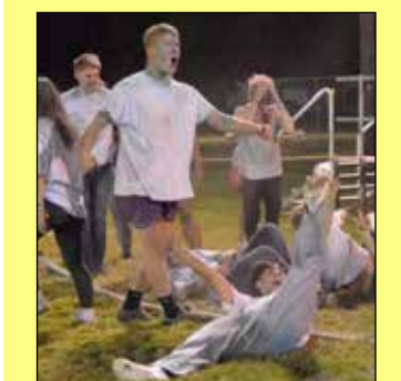
Field Night in Waitsburg (see page 5)