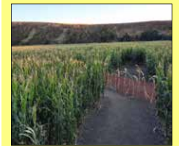
Walla Walla Corn Maze (see page 3)