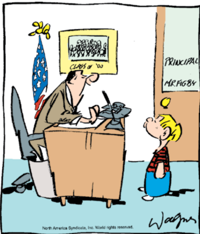
"Otis, I'd like to thank you for driving me into early retirement."