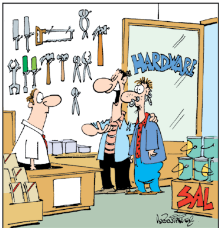
"A pair of your best wire cutters for my son, please."