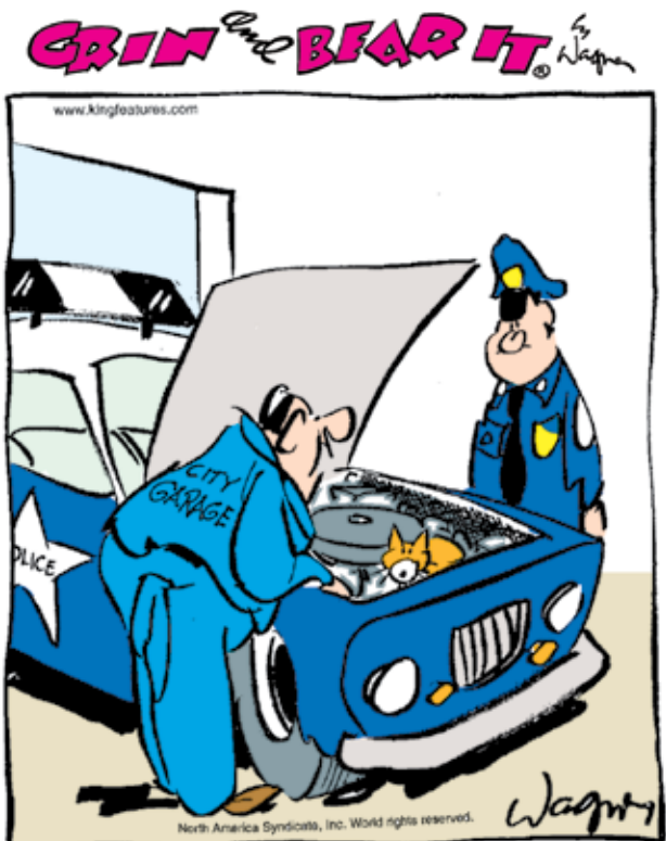
"Your siren's not stuck ... there's a cat in here."

Annual subscription rates: Walla Walla and Columbia counties - $40; Out of County - $45. We gladly accept major credit cards