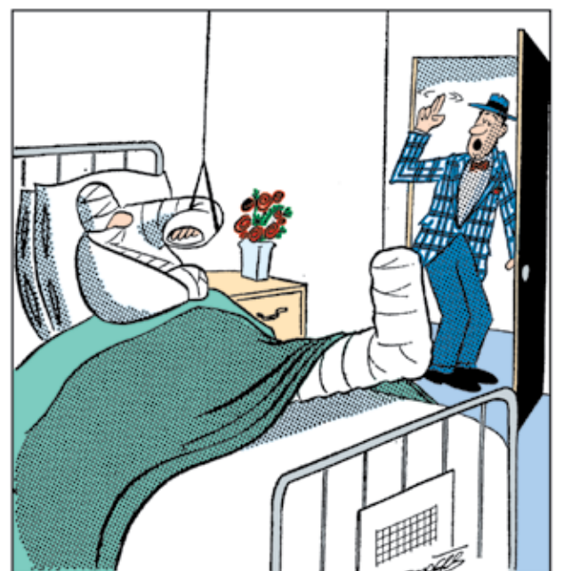
"...Have a nice weekend."