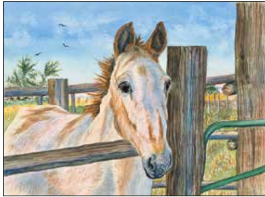
Courtesy Images Watercolors by Ellen Heath. Clockwise from left: Ben the Orange Cat, Doe and Fawn, Mule.