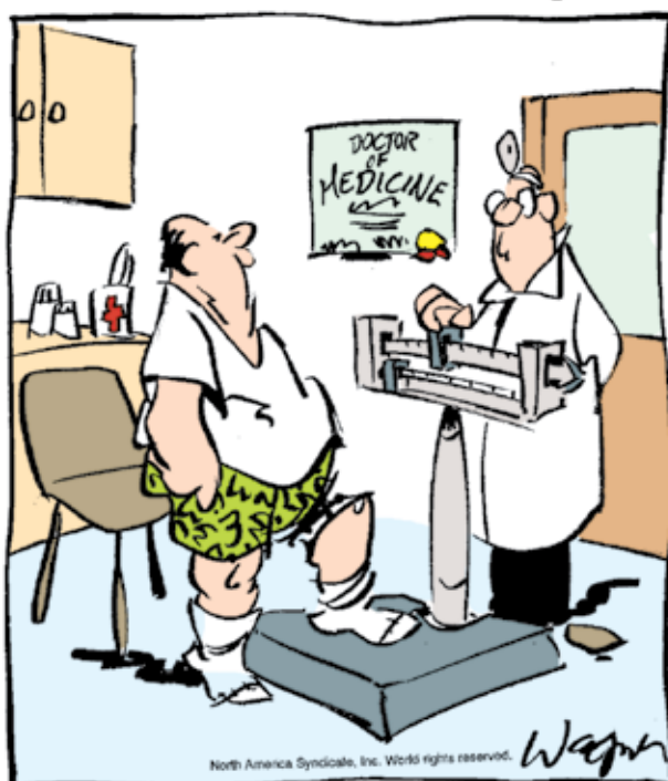
"All at once?"