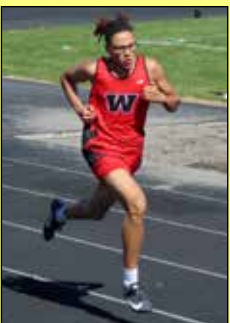
Cardinal track (see page 5)