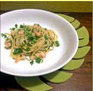
Spring Spaghetti (see page 7)