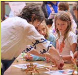
Family Science Night (see page 3)