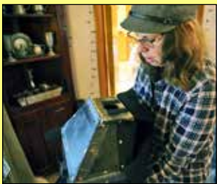
Camera Obscura (see page 5)