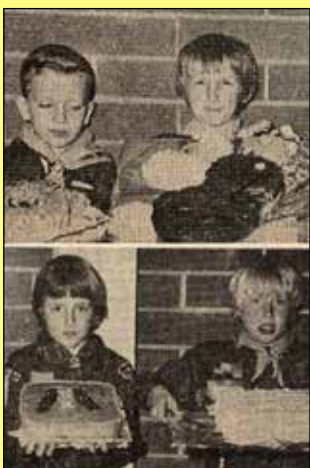
Pioneer Portraits (see page 4)